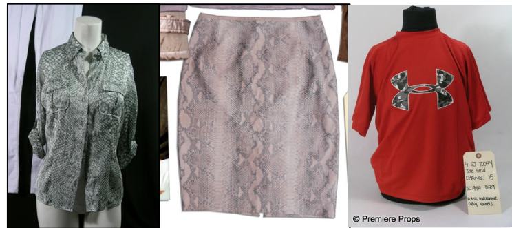
Figure 1: snakeskin button-down shirt and snakeskin pencil skirt worn by Mrs Tuohy

Numerous times Leigh-Anne Tuohy wore snakeskin prints, for example the button-down shirt and the pencil skirt (figure 1). During the film S.J is featured wearing the brand Under Armour (Figure 2) multiple times. This is accurate due to the fact that this brand was becoming increasing popular in the early 2000s. 14 The incorporation of the Briarcrest Christian School sports uniforms also suggests Hancock tried to make The Blind Side as historically accurate as possible. The football and cheerleader uniforms in the film closely resemble the uniforms of Briarcrest Christian School due to the colour scheme that features emerald green, yellow and white (figure 3 & 4) and the incorporation of Michael Oher's real jersey number, seventy-four (figure 5). As a result, Hancock used similar sport uniforms and fashion trends from the early 2000s to ensure the film was as historically accurate as possible.