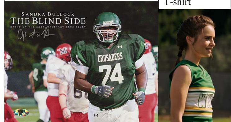
Figure 4: Michael Oher's jersey and Collins cheerleader uniform in the film.

However, Hancock was unsuccessful in using the real settings throughout The Blind Side and consequently caused the film's setting to be historically inaccurate. The Blind Side was filmed in Atlanta, Georgia when in reality Michael Oher grew up in Memphis, Tennessee and many viewers found obvious indicators that verified this. For example, a Georgia lottery sign is featured in the background of many scenes and the area code 770 phone number for Atlanta appears during a travelling scene. 15 Due to the difference in filming locations, the schools used to film The Blind Side are not the Briarcrest Christian School in which Michael attended in reality. Instead, Hancock used the Atlanta International School, Agnes Scott College and Westminster Schools to create the fictional Wingate Christian School in this film. 16 Through Hancock not filming The Blind Side in the real setting of Memphis, the film's setting is historically inaccurate as other schools had to be used in the replacement of Briarcrest Christian School. However, this should be dismissed as the film is more importantly focused on the characters and historical events, and not the location.